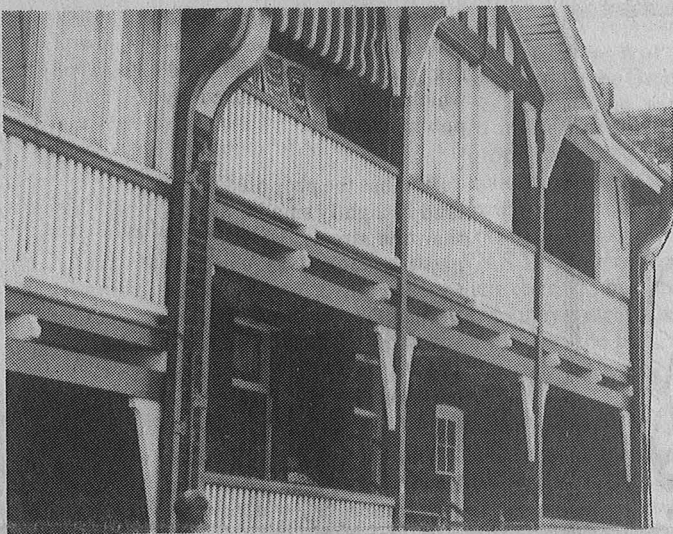
These flats in Little High Street, in the Rocks are vacant. Like many of other flats in the area the interior has been left to deteriorate because of Maritime Service Board neglect.

The Housing Minister has given such an assurance.